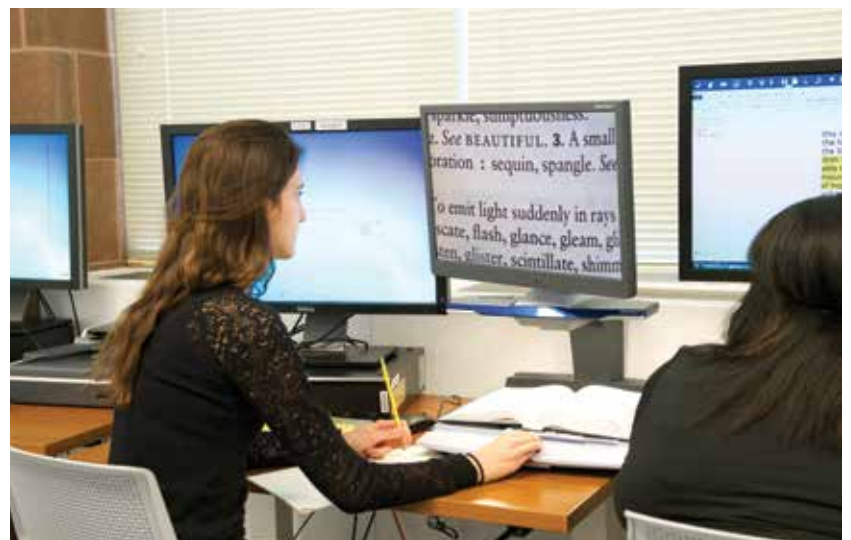
Accessibility at BMCC is provided through online courses and assistive software.